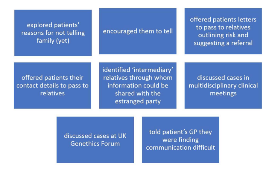
Figure 1 Healthcare professionals' conventional ways of dealing with non-disclosure.

Only some participants talked about personal and familial genetic information as being separable. For example, one participant recalled a case where a new patient concerned about his risk for a familial cancer syndrome had an 'inkling' about where distant affected relatives lived. The participant found an old report